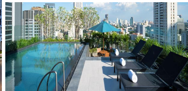
Hyatt Place Bangkok Sukhumvit