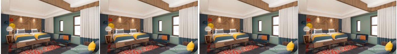
Superior Room Superior Room Superior Room Superior Room Superior Room Club Quad Room Deluxe Room with Mountain View Quad Suite with Mountain View